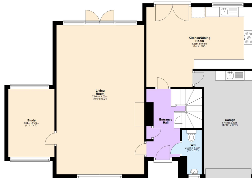
Ground Floor Approx. 93.9 sq. metres (1011.1 sq. feet)