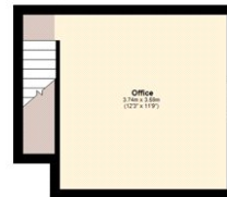
Basement Approx. 15.8 sq. metres (169.6 sq. feet)